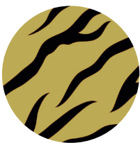
TIGER 1: STRIPES