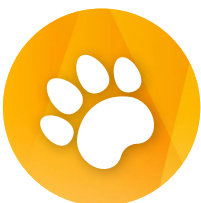
TIGER 2: PAWS