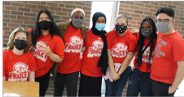
FHS sophomores wearing their class t-shirts on Sept. 30. Students celebrated through the week with Student Council-organized Spirit Days