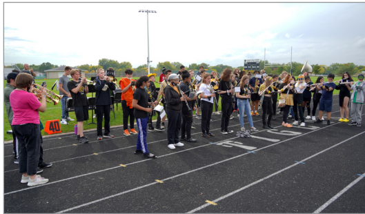
Fridley High School varsity band members played the "Fridley Fight Song" at the homecoming pep fest.