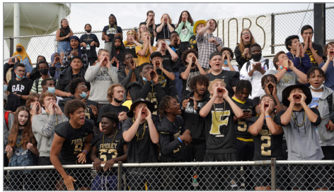
Fridley High School held its annual homecoming pep fest outdoors at FHS Stadium on Oct. 1. Students enjoyed games including tug-of-war and go-kart races.